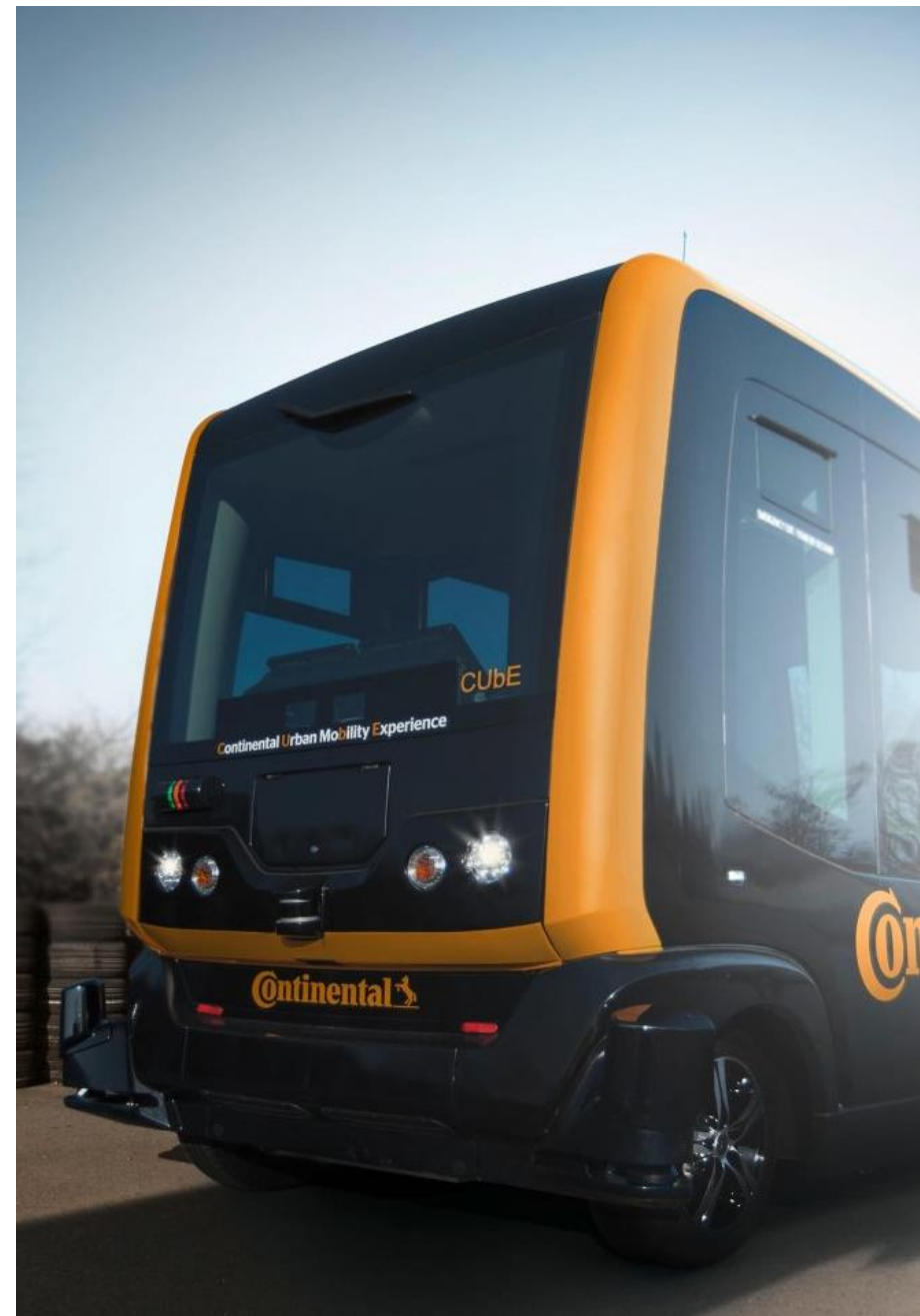
CUBE (Continental Urban mobility Experience)